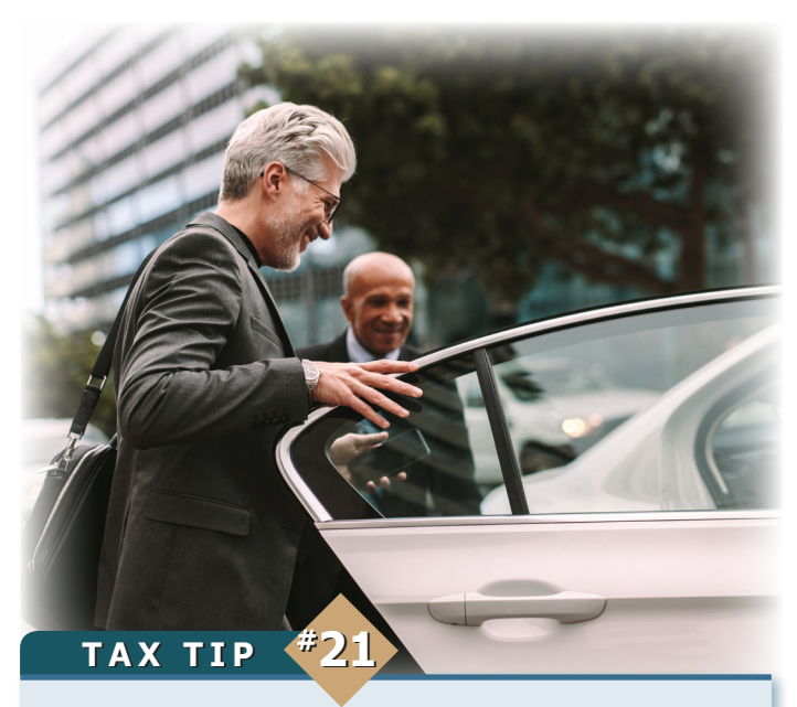
If traveling for business, many expenses are deductible. Be certain that they are reasonable and you document the date, place, and amount of the expense. In addition, substantial business discussion must take place.