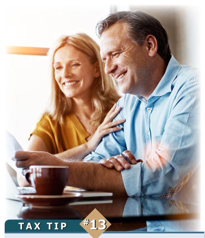
Try to hold on to stocks for at least a year if you have a gain. The short-term capital gains tax may have you paying more.

Always review gains and losses before the end of the year so you can offset gains and make sure you have paid enough in estimated taxes.