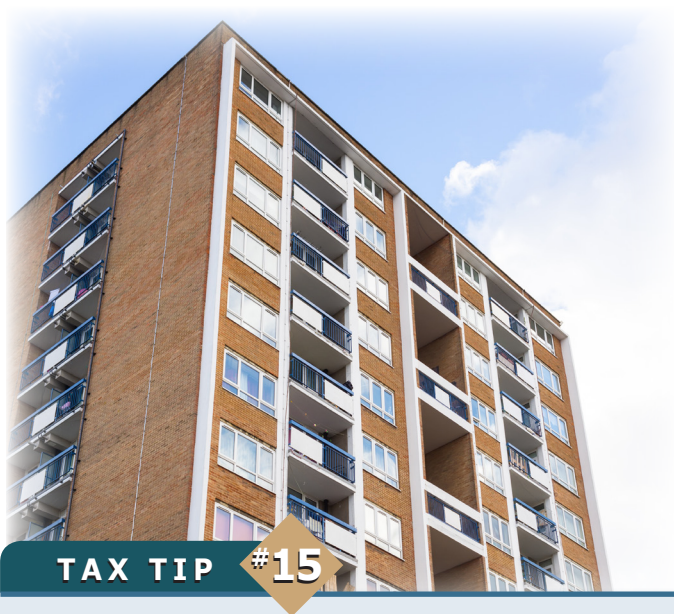
A 1031 Tax Deferred Real Estate Exchange postpones the payment of Federal Taxes until the property is actually sold.

If you are a real estate investor or builder, you can reduce your tax bill with the low-income housing tax credit. This annual credit applies to your qualified new low-income housing construction costs. The credit is granted for ten consecutive years. Some or all of it can be taken against tax on any type of income, and the unused credit can be carried forward or carried back. For Federally subsidized construction, and for existing housing acquisition, there is a similar credit. The Tax Cuts and Jobs Act lowered the corporate tax rate from 35 to 21 percent, which impacts pricing for the housing credit and affordable housing production, but did retain the credit.